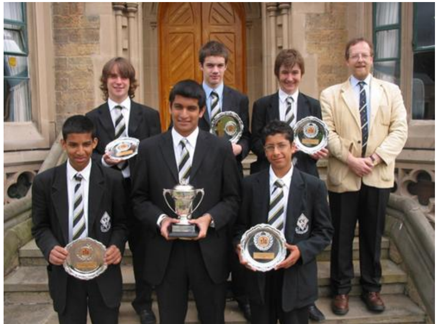
Notingham High School Team - Winners of the BCF Schools Championship