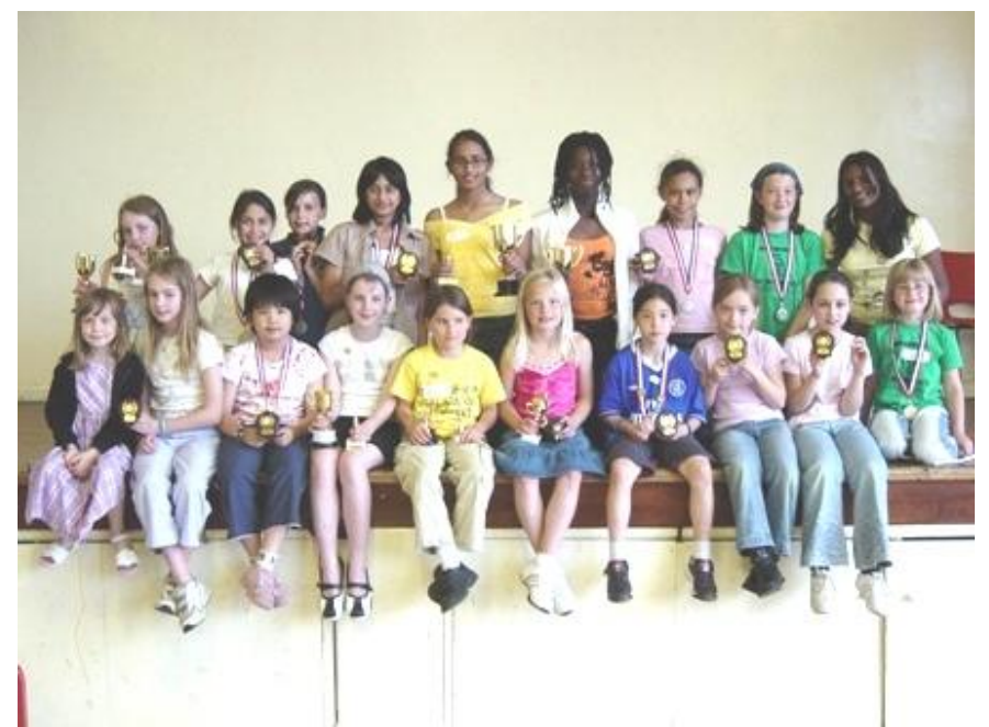
Young ladies with their prizes at the All England Gold Finals in Nottingham