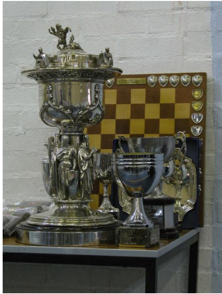
Various County and Club BCF trophies waiting to be won. The Open Lowenthal Cup definitely needs 2 hands!!