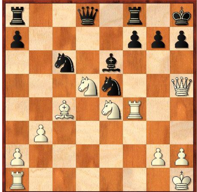
21 .....Bxd5 22. Bxd5 Qxd5 {Good play. rejecting the sac by 22...f6 would have been better for White.} 23.Rh4 h6 24. Rd1 Qa5 25. b4 Qxb4 26. Nf6 Qe7 {26...Qxh4 would have made the game last longer} 27. Rf1 Rfd8 0-1

1. e4 c5 2. Nf3 e6 3. d4 cxd4 4. Nxd4 Nc6 5. Nc3 d6 6. Be2 Nf6 7. O-O Be7 8. Be3 O-O 9. f4 e5 10. Nb3 exf4 11. Bxf4 Be6 12. Kh1 d5 13. e5 Nd7 14. Nxd5 Ndxe5 15. c4 Bg5 16. Nc5 Bxf4 17. Rxf4 b6 18. Ne4 b5 19. b3 bxc4 20. Bxc4 Kh8 21. Qh5{A somewhat speculative sacrifice}