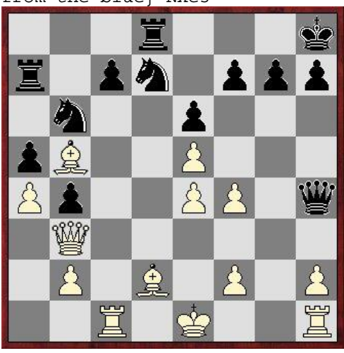
The Middle Game -9-

1. d4 d5 2. c4 dxc4 3. Nf3 a6 4.e3 Bg4 5. Bxc4 e6 6. Qb3 Bxf3 7. gxf3 b5 8. Be2 Nd7 9. a4 b4 10. f4 Ngf6 11.Bf3 Ra7 12. Bc6 Be7 13. Nd2 O-O 14. Nc4 a5 15. Ne5 Nb8 16. Bd2 Nd5 17. e4 Nb6 18. Be3 Bd6 19. Bb5 Qh4 20. Rc1 Kh8 21. Be2 Bxe5 22. dxe5 N8d7 23. Bb5 Rd8 24.Bd2 {Now a bolt from the blue} Nxe5