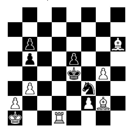
The Indian Problem : White to play and mate in 4

After 1830 solving began to encompass an ever widening circle and by mid-century the founding principles of the current art of problem composition began to evolve. A new era of problems was ushered in when the Rev. Henry A Loveday's famous "Indian Problem" was published in 1845.